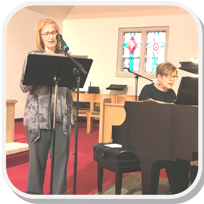
Holden Evening Prayer Lenten Worship