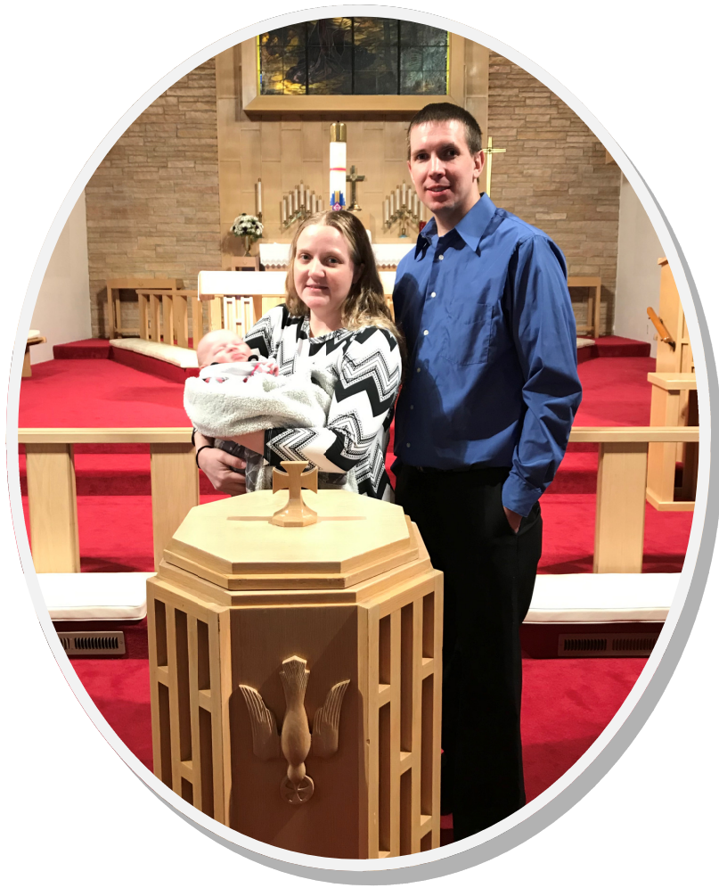
Baptism, March 3: