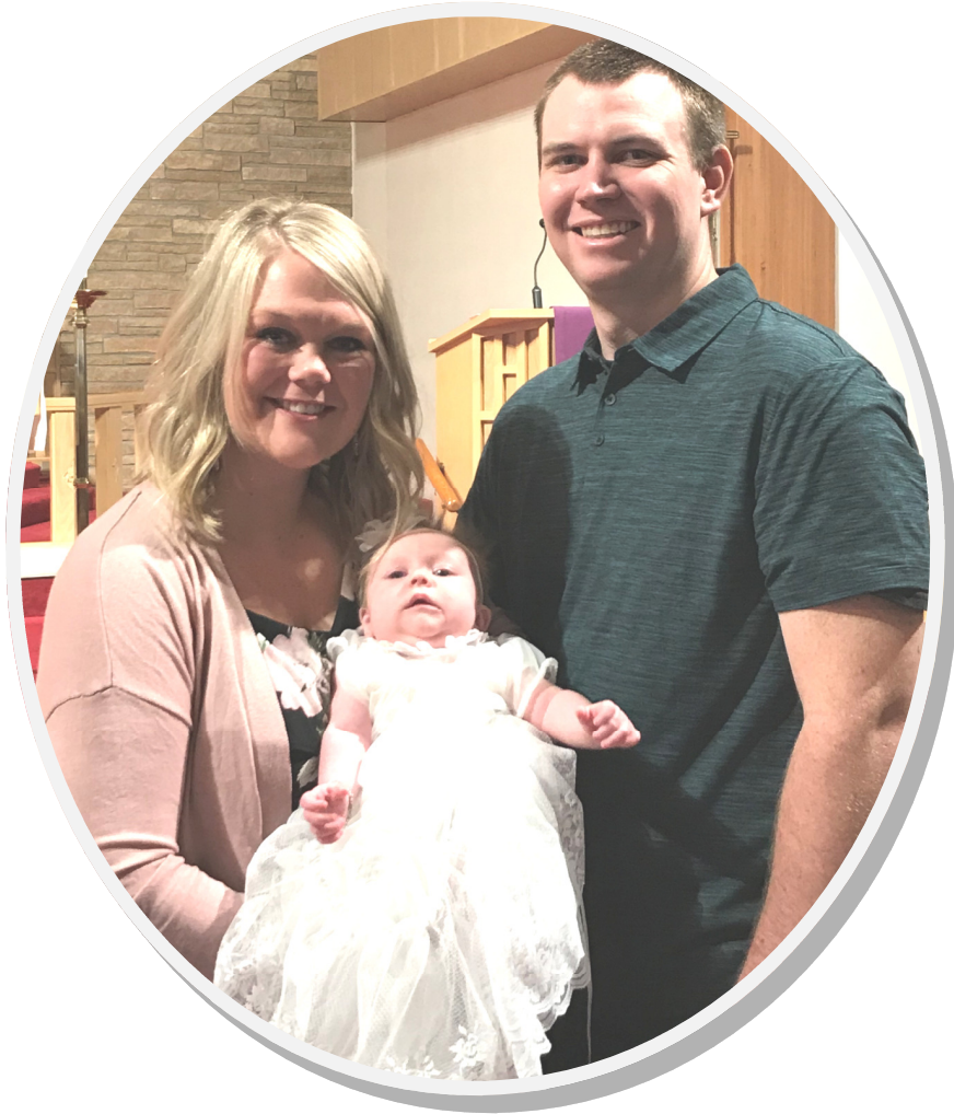
Baptism, March 17